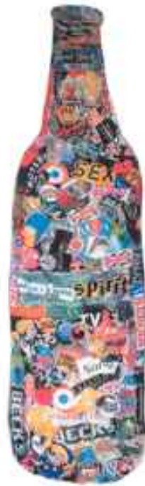
Artwork by a Lifeshaper student

Lifeshaper runs in Aberdeen City and in North Aberdeenshire.